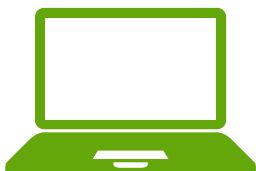
Public Mutual Online (PMO)