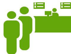
Public Mutual Customer Service Centres

Priority clients may access the exclusive Mutual Gold Service for value-added, time saving services.