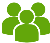
UTCs and corporate representatives who are registered with FIMM