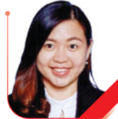
TAN SU THIN